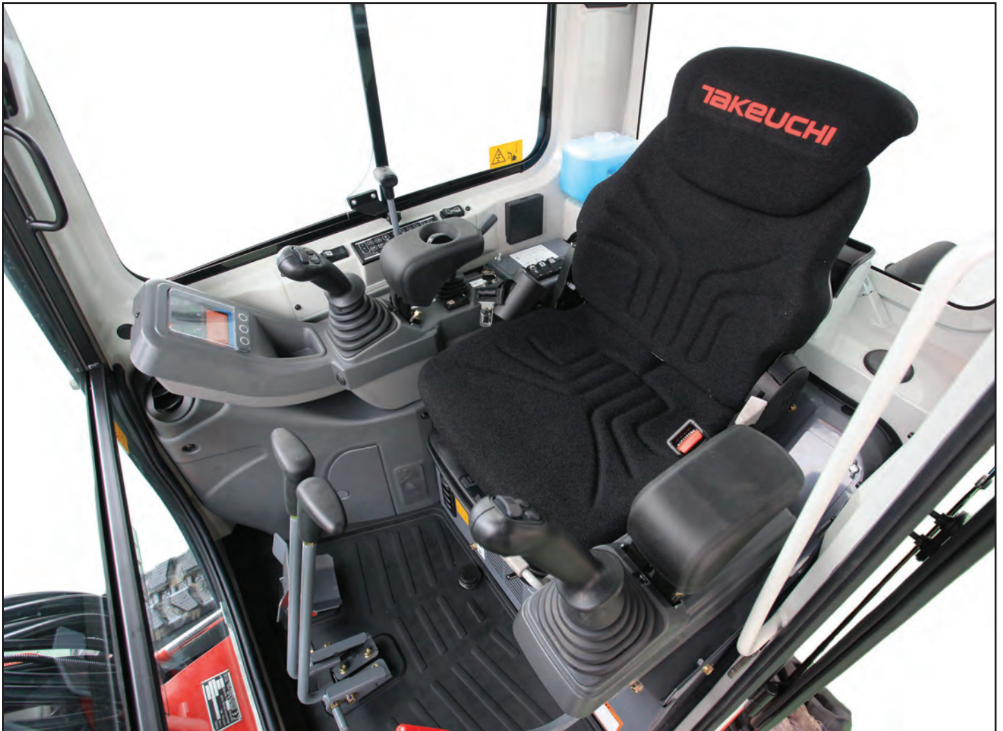
Spacious Operator's Station with Easy to Reach Controls and Switches.

The operator is protected by a ROPS / TOPS / OPG protective structure that keeps the operator safe and comfortable on any job site.