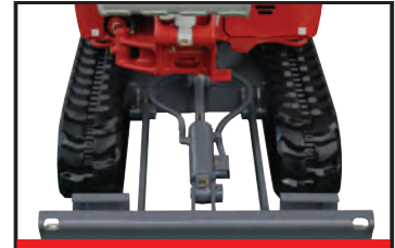
Retractable Track Frame

The TB225 features all steel construction, a spacious operator station, smooth hydraulic pilot joystick controls that deliver precise responsive controls. The TB225 provides the operator with the best in class engine output that allows more power and increases productivity.