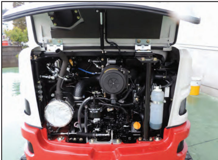
Large Lockable Service Covers Provide Ground Level Access