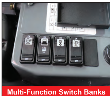
Multi-Function Switch Banks