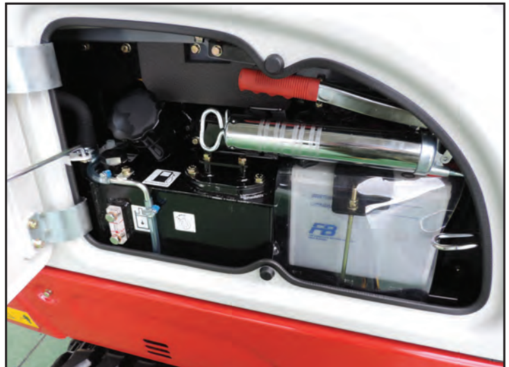
Convenient Service and Maintenance Access