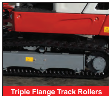
Triple Flange Track Rollers