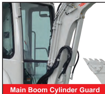
Main Boom Cylinder Guard