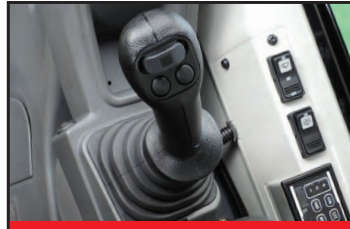
Pilot Operated Controls